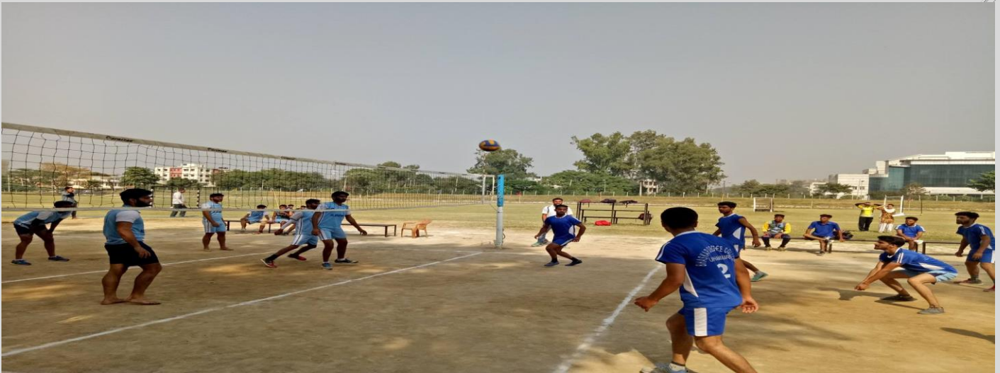
10 th Oct 2018: Volley Ball team of the college participated in Inter College Volley Ball tournament organized by Directorate of Sports and Physical Education, University of Jammu.