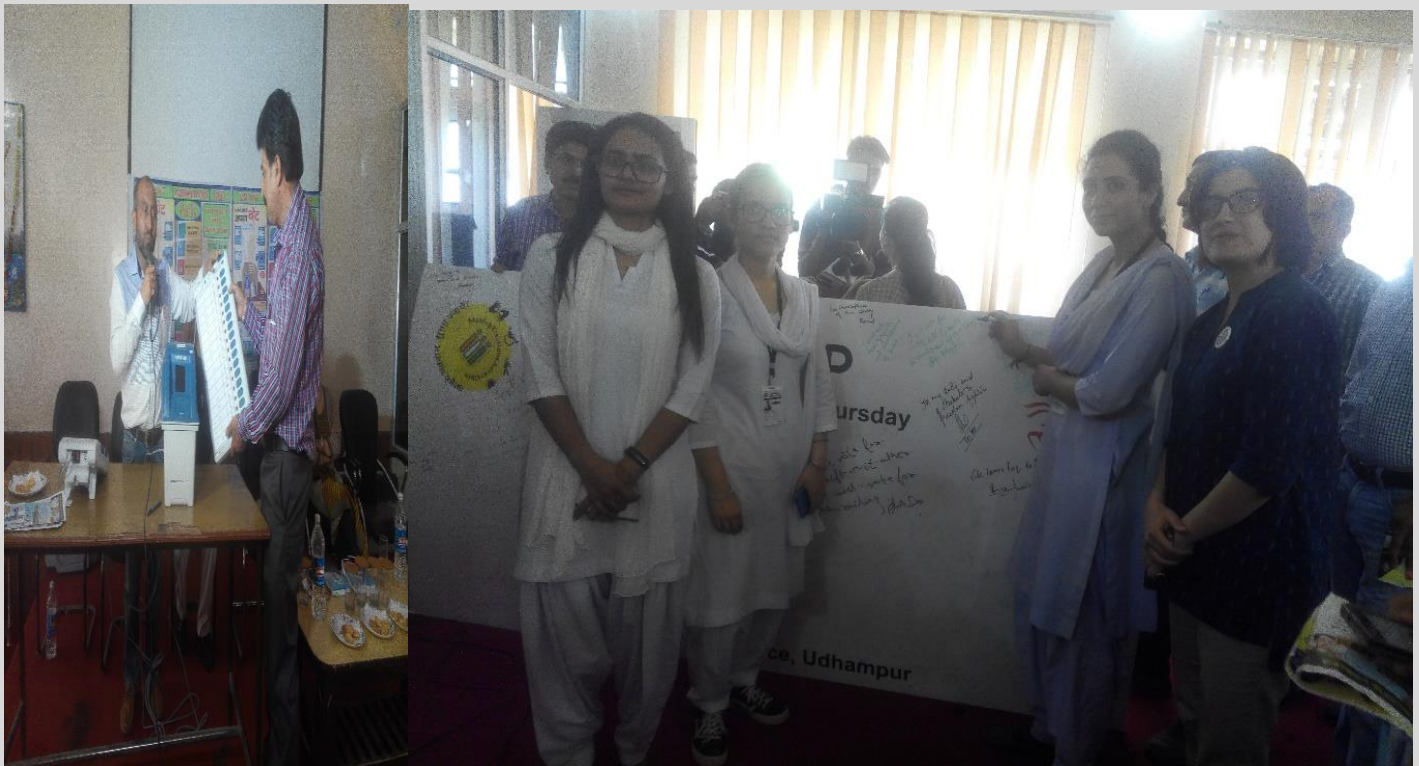
2 nd April 2019: Students of the College participated in a workshop on SVEEP Organized by Govt. Degree College, Udhampur . The workshop emphasized on the issue of voter education, spreading voter awareness and promoting voter literacy in India.