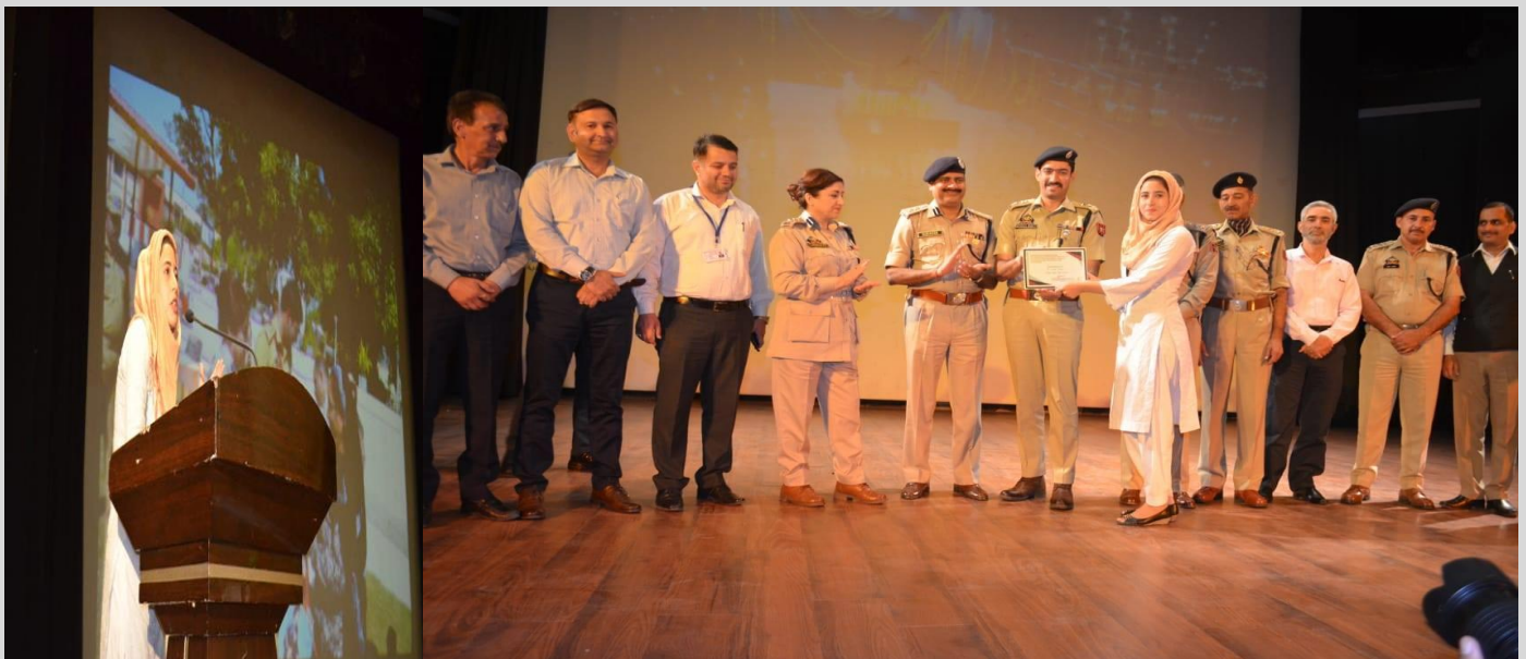
23 rd Oct, 2018: The students participation at , ‘Mushaira’ (Poetic Event) under the theme "Martyrs Day" organized by Sher-e-Kashmir Police Academy Auditorium, Udhampur