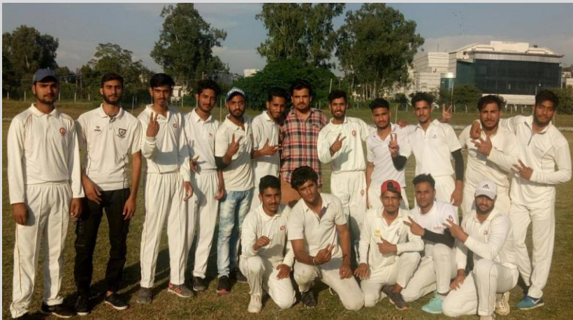
22nd Oct, 2018: College Wins league Cricket match against PG Department of Law and Science, University of Jammu organized by Directorate of Sports and Physical Education, University of Jammu in inter-college Cricket Tournament held at University of Jammu.