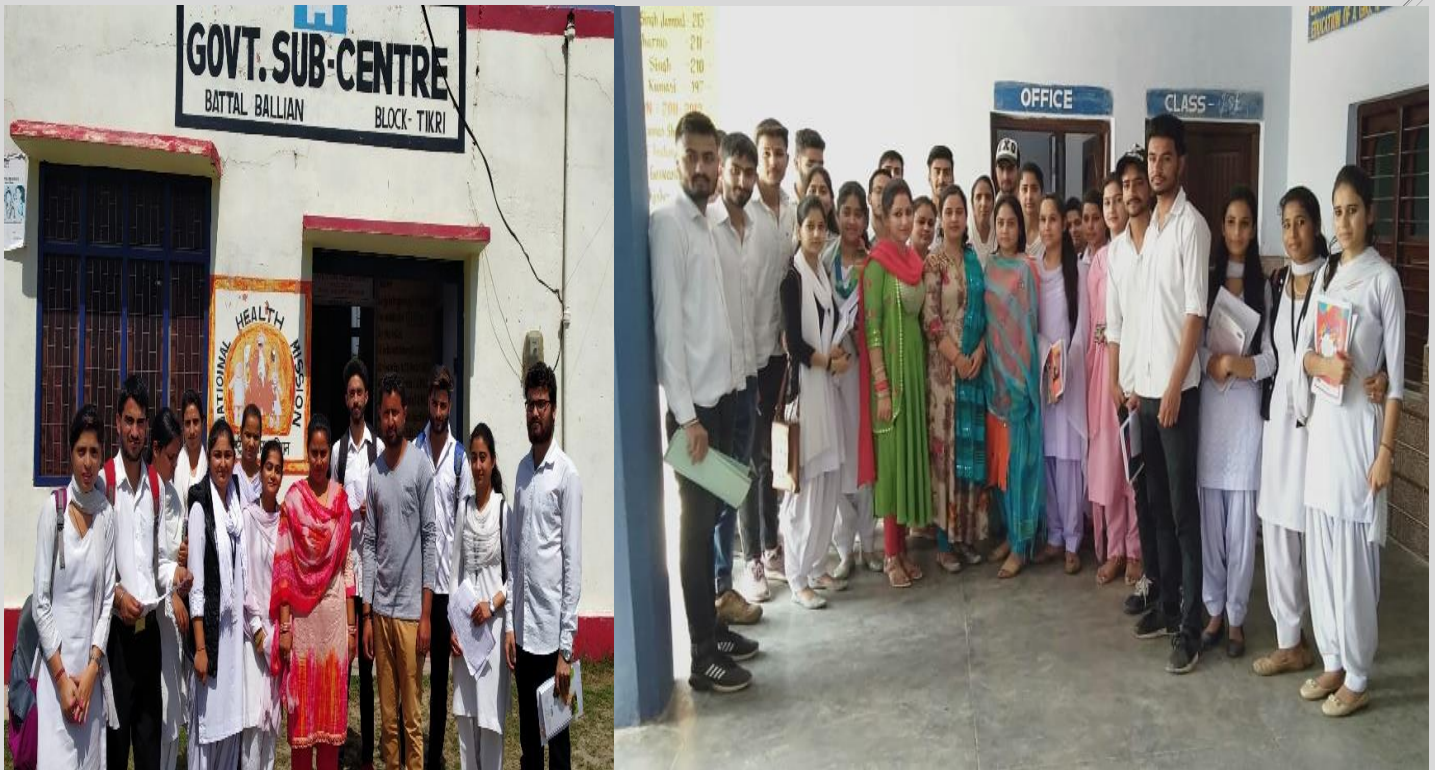
30 th March, 2019: A field visit of B.A. SEM 6 th of Socio-Economic Survey was organized at of “ Rural Area Battal Ballian Udhampur ”, in which 62 students participated and observed the socio-economic conditions of the village through Questionnaire by introspection method.