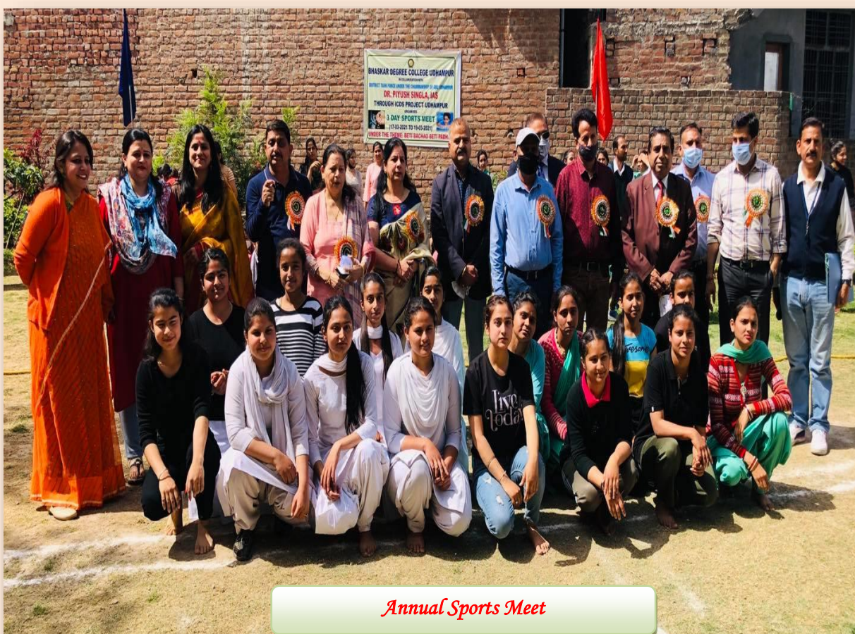
Annual Sports Meet