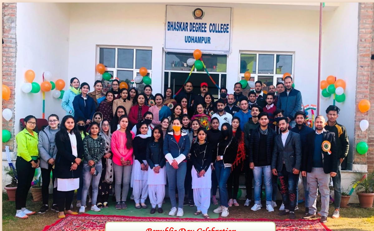
Republic Day Celebration